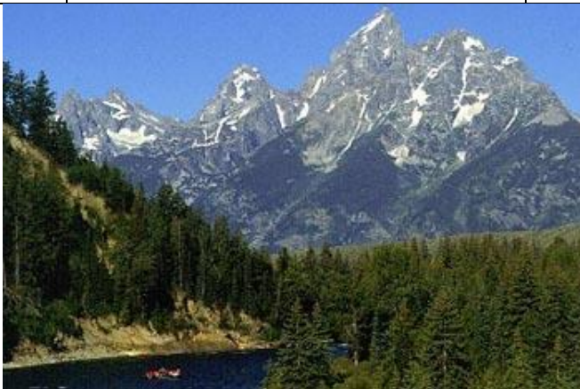
Snake River River